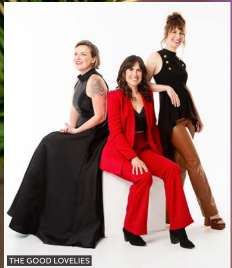
THE GOOD LOVELIES

Whether you're looking for holiday classics or something totally new, the Capitol's holiday concerts will keep you dancing through the season and right to the new year!